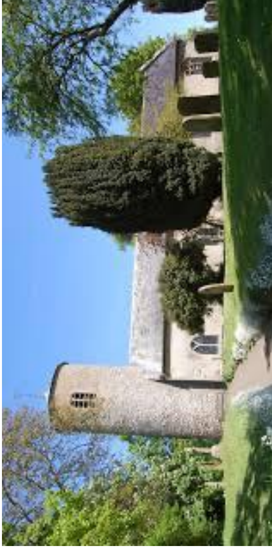
St Mary's Church, Syderstone.