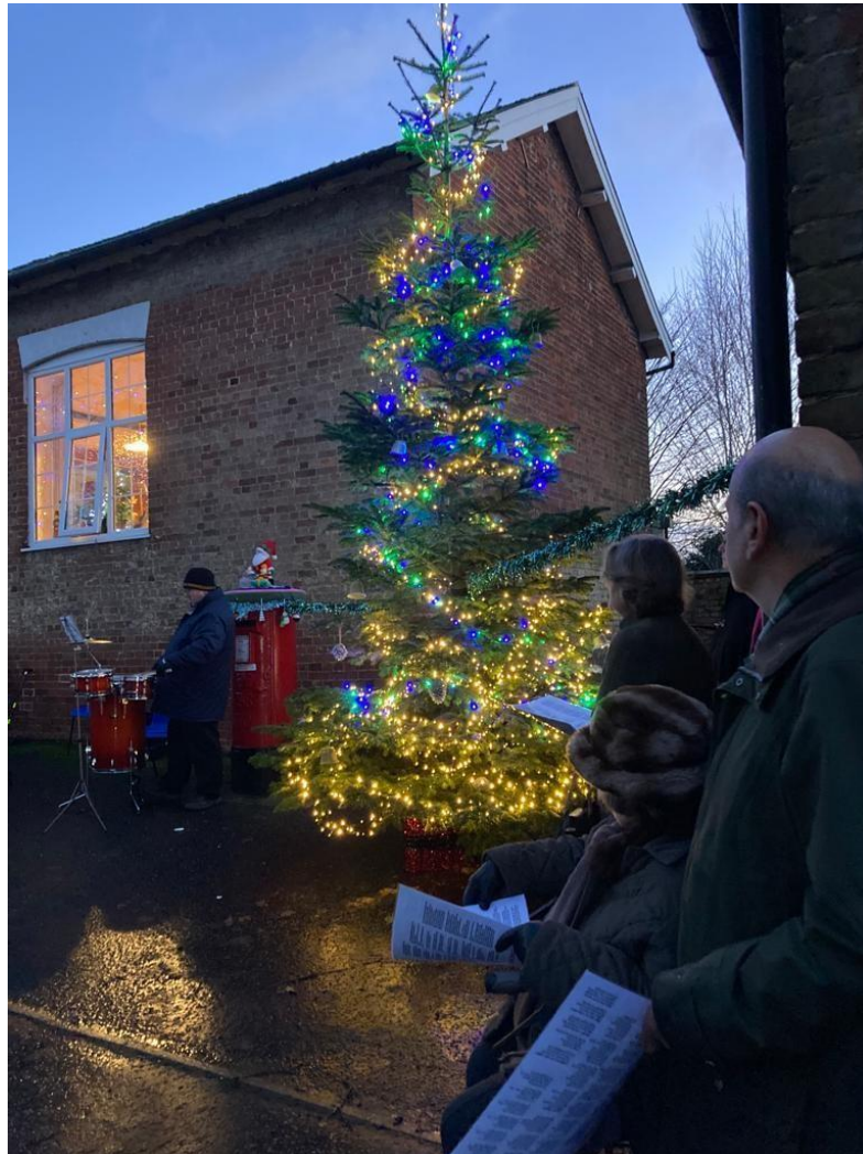
Syderstone Christmas tree last year

Welcome to the Winter 2022 edition of Syderstone's Natterjack Newsletter